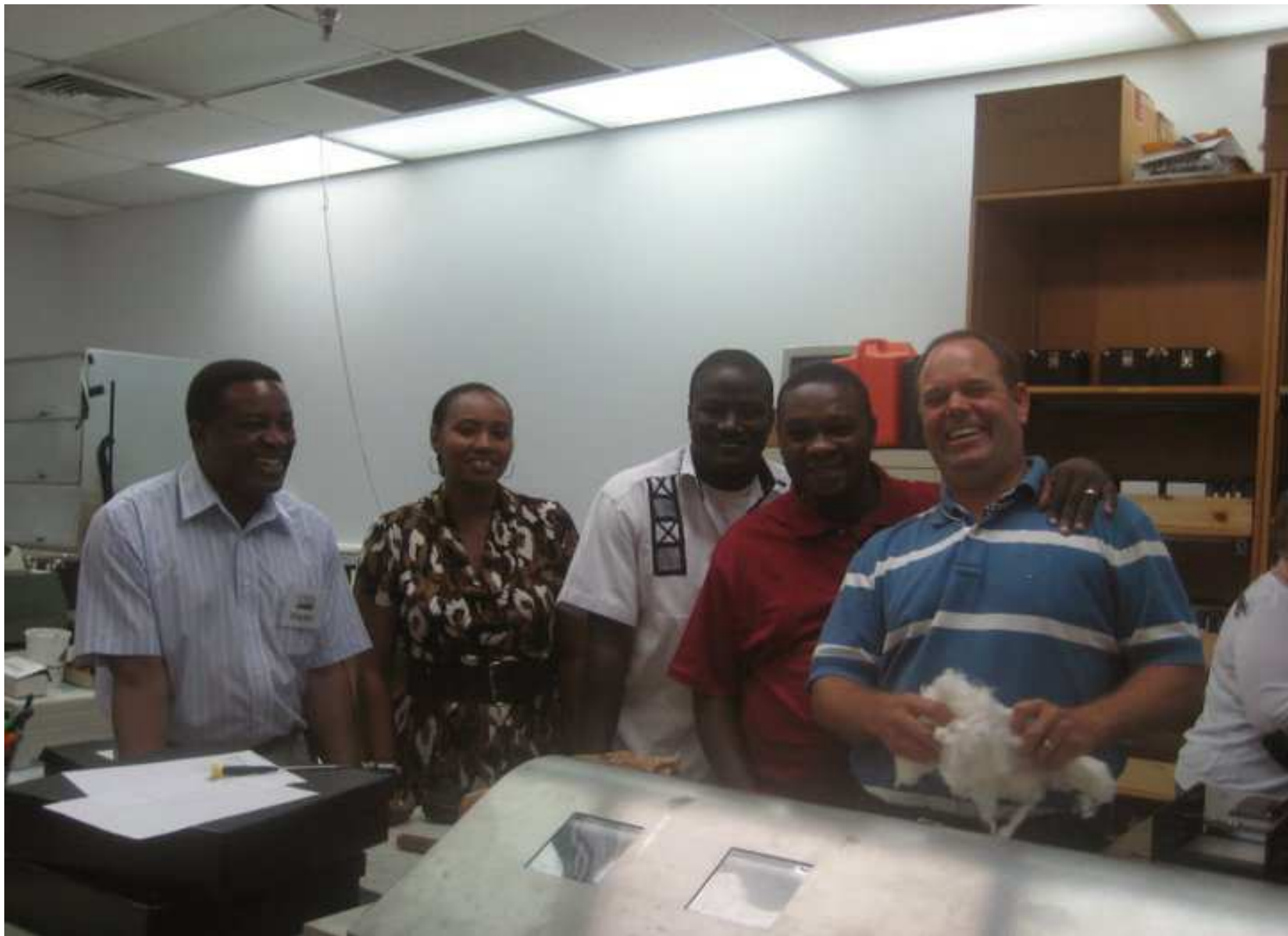
RTC EXPERTS TRAINING IN MEMPHIS