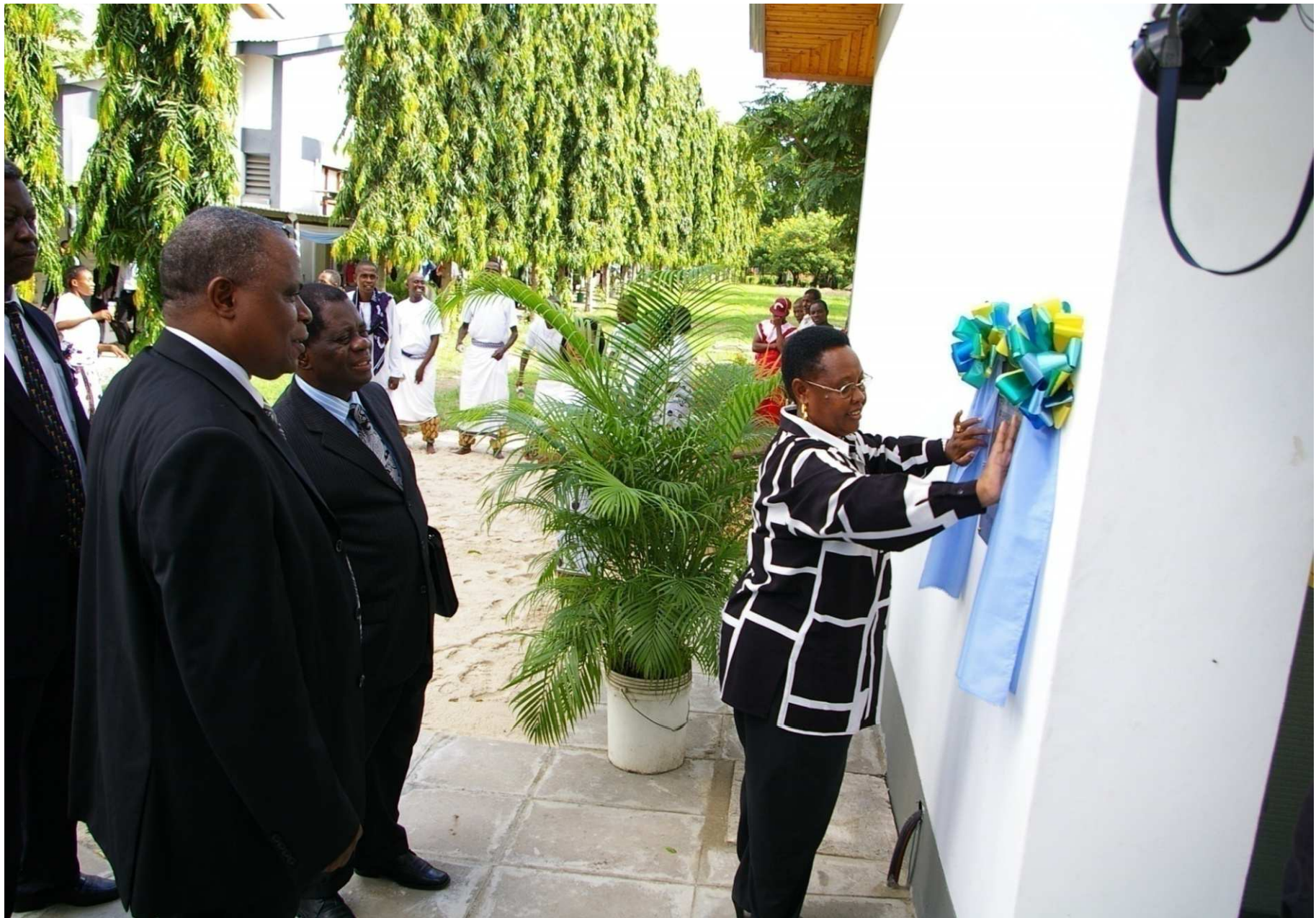
THE MINISTER OF INDUSTRY UNVEILS THE PLAQUE FOR THE RTC EAST/SOUTHERN AFRICA LABORATORY