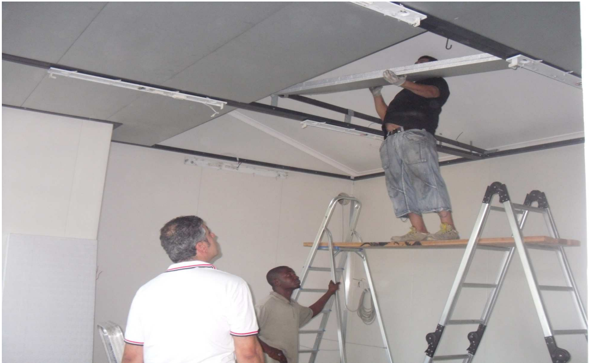
TECHNICIANS INSULATING THE CEILING OF THE RTC EAST/SOUTHERN AFRICA LABORATORY