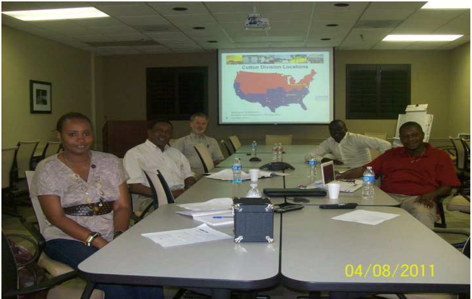
RTC EXPERTS UNDERGOING TRAINING ON INSTRUMENT TESTING AT USDA-MEMPHIS