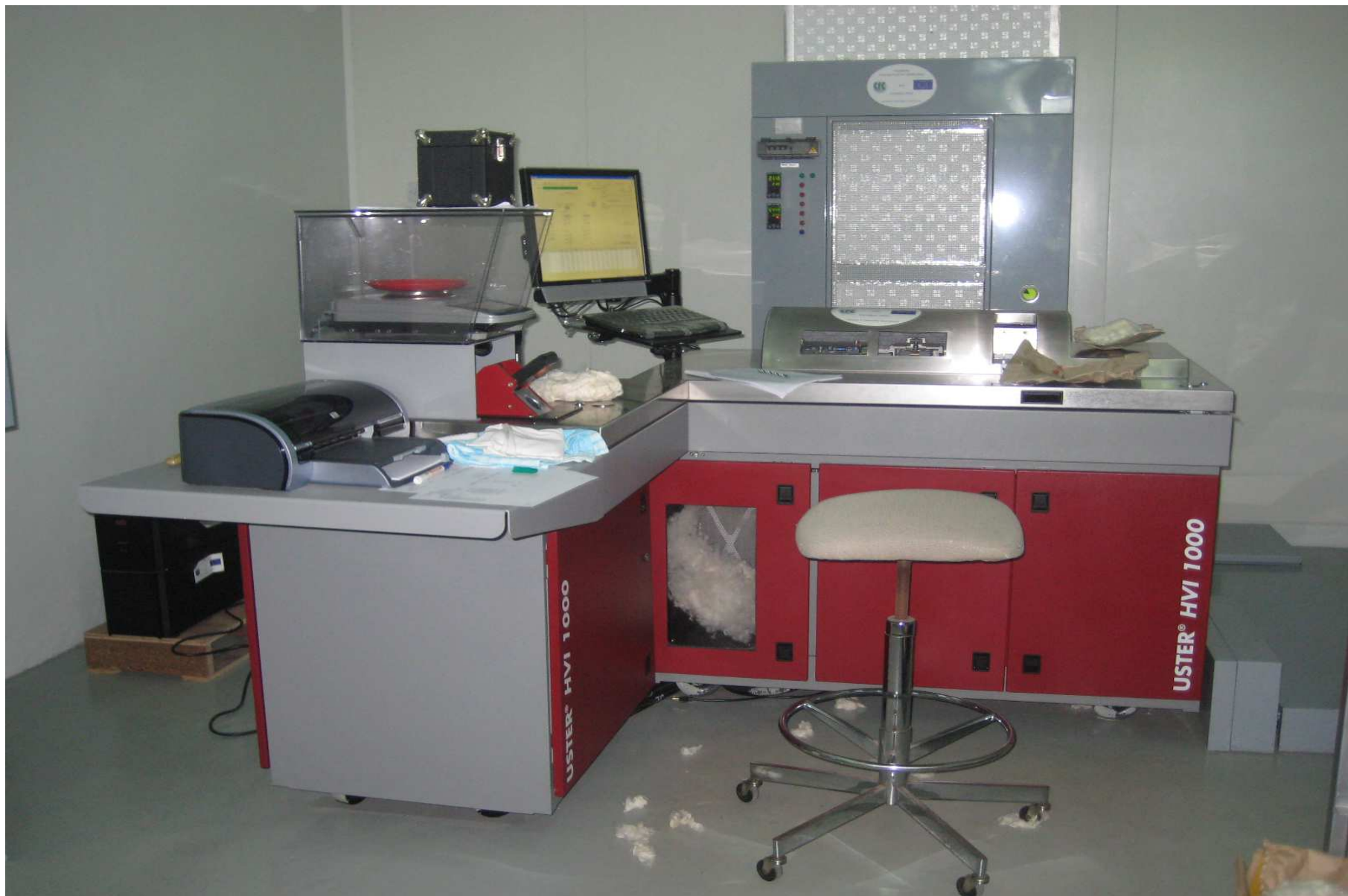
THE USTER HVI 1000M700 INSTALLED AT RTC EAST/SOUTHERN AFRICA LABORATORY