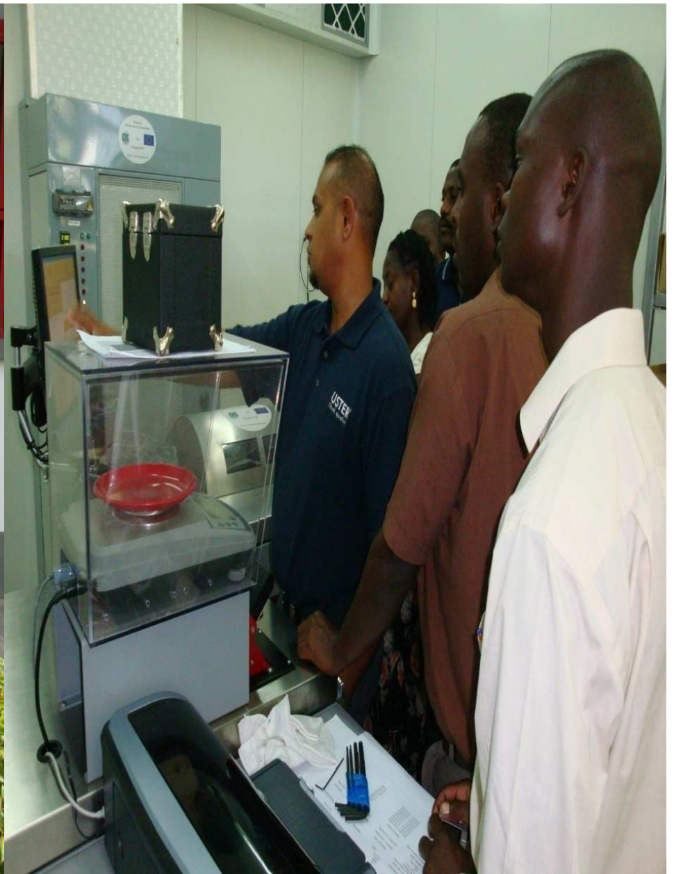
A GROUP OF TECHNICIANS ATTENDED A TRAINING ON TROUBLE SHOOTING OF USTER INSTRUMENTS