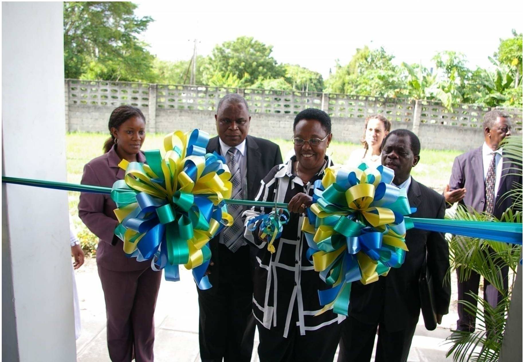
THE MINISTER CUTS THE TAPE TO MARK THE OFFICIAL OPENING OF THE CENTRE