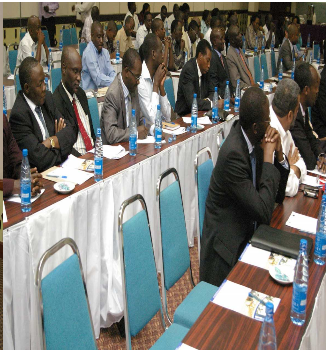
PARTICIPANTS LISTENING TO A PRESENTER DURING AWARENESS SEMINAR IN DAR ES SALAAM