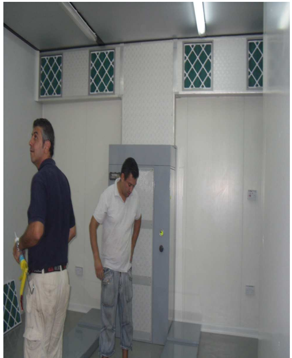
LEFT; ONE OF THE SIMPLEX UNITS UNDER INSTALLATION RIGHT; BRANCA TECHNICIANS INSPECTING THEIR AAMS INSTALLATION WORK