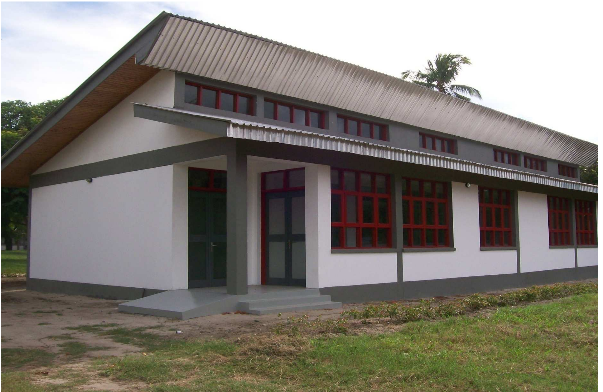
RTC EAST/SOUTHERN AFRICA LABORATORY BUILDING