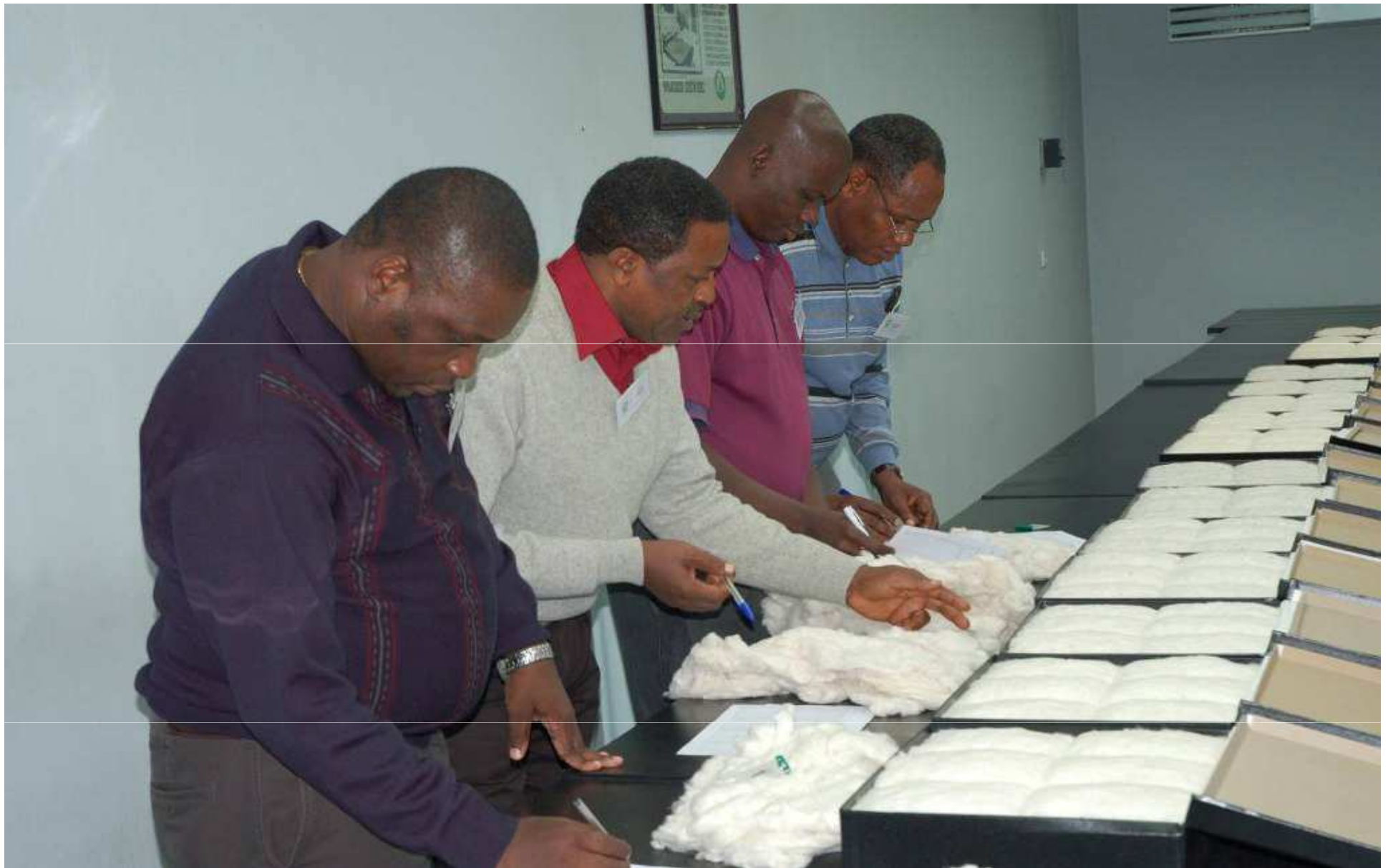
RTC EXPERTS ATTENDING A TRAINING AT GYDNIA COTTON ASSOCIATION IN POLAND