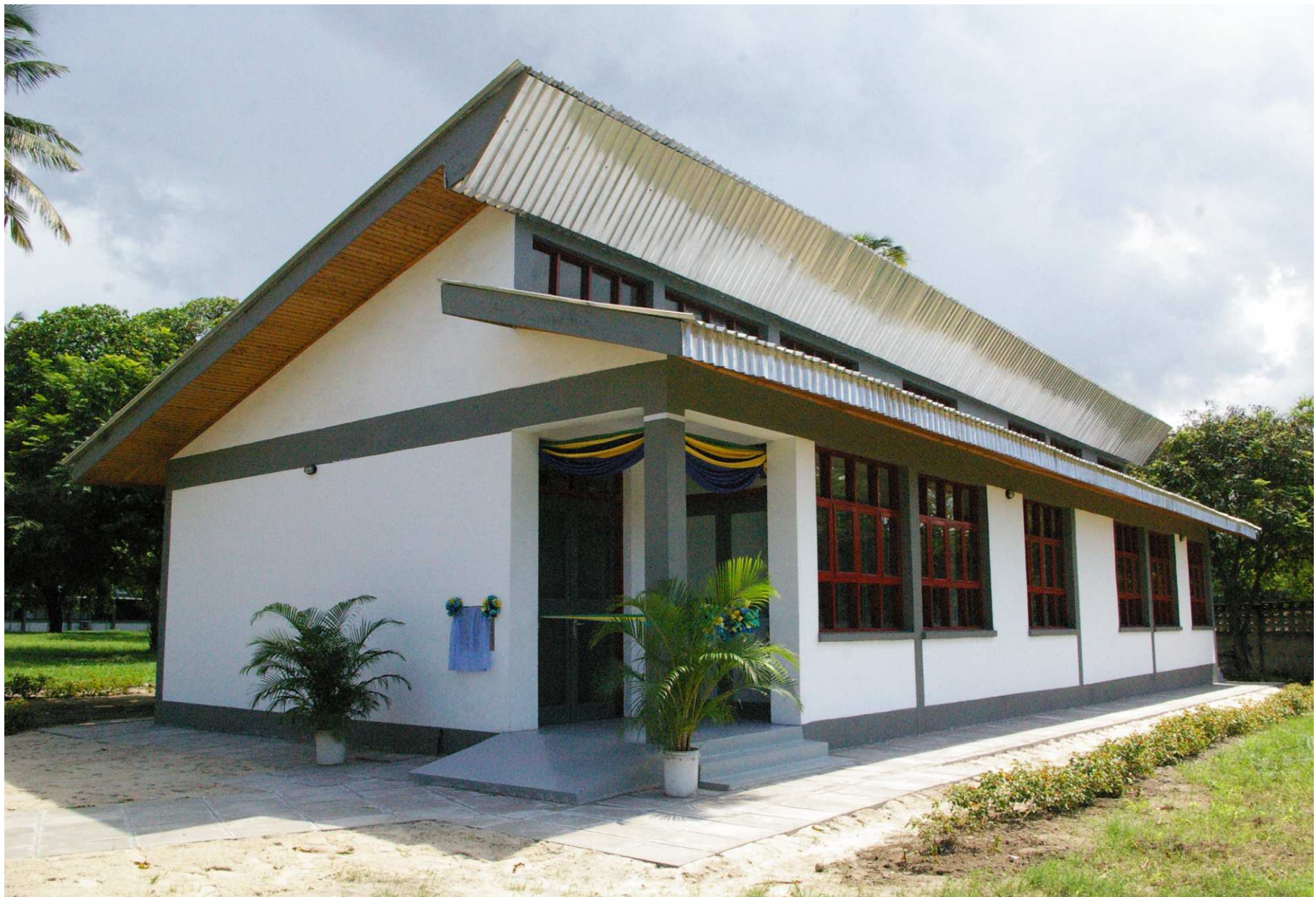
THE RTC EAST/SOUTHERN AFRICA LABORATORY BUILDING WHICH WAS OFFICIALLY INAUGURATED ON 8 TH APRIL, 2010.