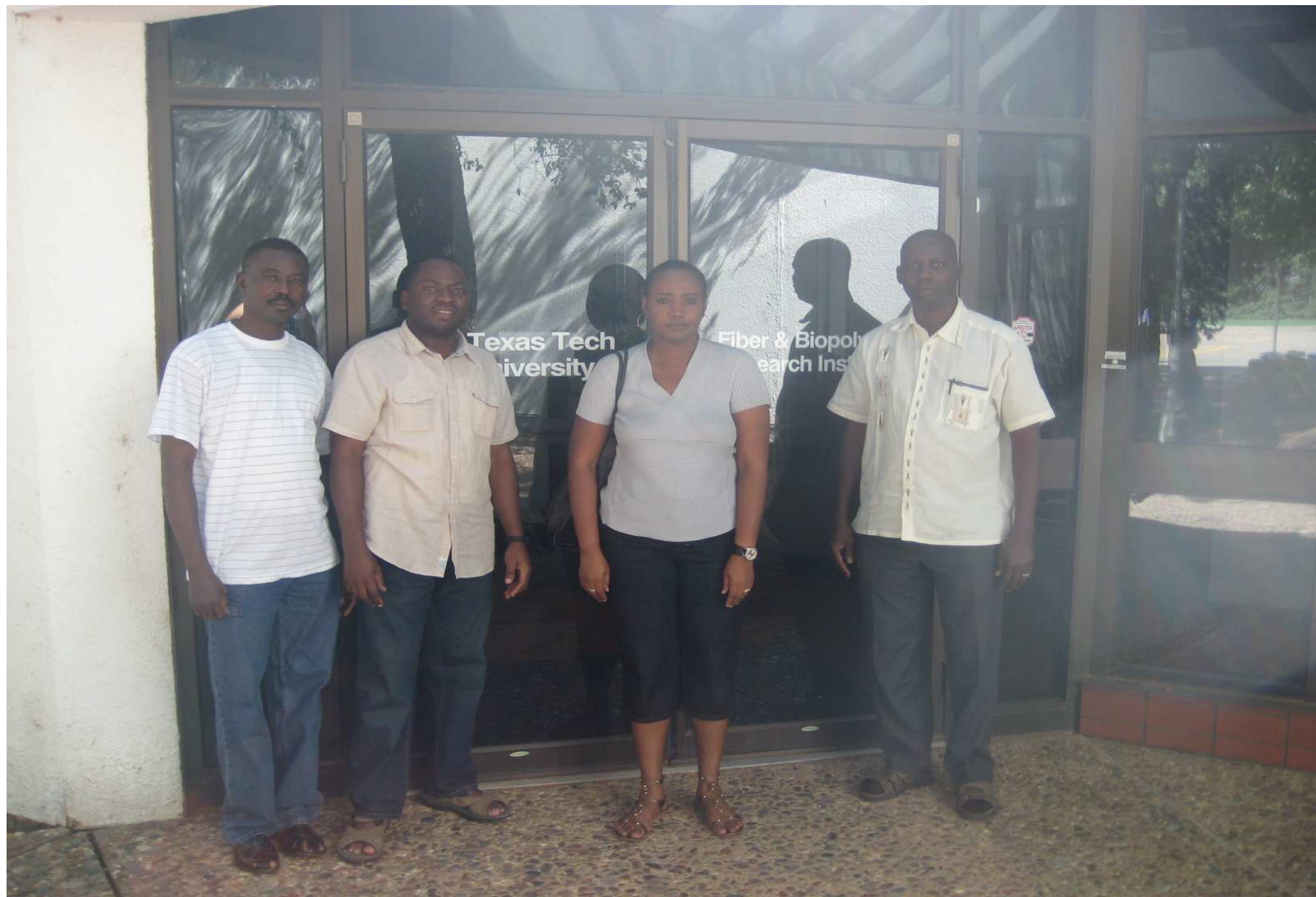
RTC EXPERTS ATTENDED A TRAINING AT THE TEXAS INTERNATIONAL COTTON SCHOOL