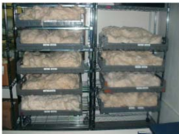
Figures: Storage of samples for conditioning [Uster]

(Recommendations) It is important to undertake regular checks of the moisture content of the cotton samples. For Upland cottons, the moisture content should not exceed the range of 6.75 to 8.25% (dry basis) and should not vary by more than 1 percentage point from that of the Calibration Cottons. Out of range samples should be allowed additional conditioning time. If the range is still not achieved, then the sample should be marked as exceptional.