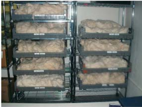
Figures: Storage of samples for conditioning [Uster]

(Recommendations) It is important to undertake regular checks of the moisture content of the cotton samples. For Upland cottons, the moisture content should not exceed the range of 6.75 to 8.25% (dry basis) and should not vary by more than 1 percentage point from that of the Calibration Cottons. Out of range samples should be allowed additional conditioning time. If the range is still not achieved, then the sample should be marked as exceptional.